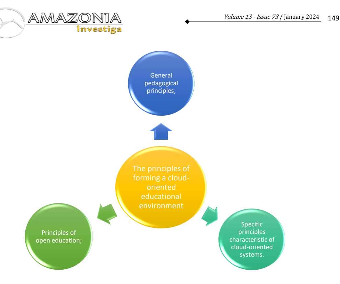
Figure 3. The principles of forming a cloud-oriented educational environment (Nosenko et al., 2016).

Experimental verification of the effectiveness of the ways of using a cloud-oriented educational and scientific environment for the formation of the teacher's professional position.